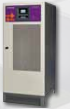
Power Conversion System and Storage