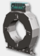
0.2 s Current transformer