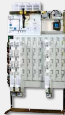
TIPI with DIRIS