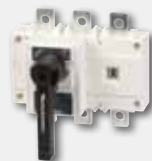
Load break switches