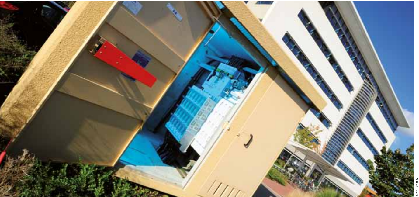
MV/LV public distribution substation with SOCOMEC TIPI feeder pillar